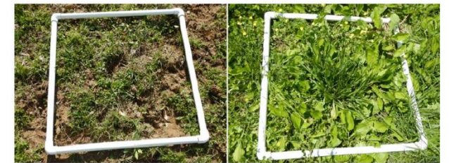
Figure 2. Images used for modeling presence of fescue abundance, toxic to pregnant mares and foals. Credit to Dr. Toshi Mizuta